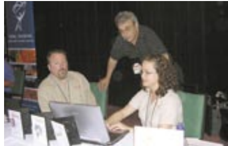
Senior industry professionals share their insights.

This process uses PDF files to efficiently move the construction documents from the factory to the third-party review agency and on to the regulatory and permitting agency before construction can begin. Session will focus on the timesaving aspects of using Acrobat 7, and the recently proposed PDF/E standard over the traditional 'paper version' of the same process, as well as the added security capabilities that can be used.