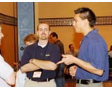
Interact with professionals and colleagues.

This session is composed of three 30 minute sessions examining a variety of practical and extraordinary uses of PDF across a variety of businesses and organizations. From electronic brochures with multimedia, through multilingual documents, and dynamic content with Javascript, you'll see the many faces of PDF.