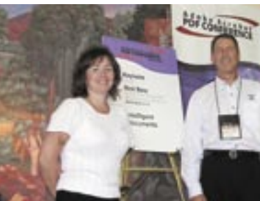
Listen to informative keynote speakers.

Adobe's PDF solutions go well beyond creating PDF files on the desktop or collecting forms data using PDF. Adobe LiveCycle server products create and integrate PDF Documents with enterprise applications and business processes. In this session, you'll discover tools that allow you to manage business processes and enable more secure communications