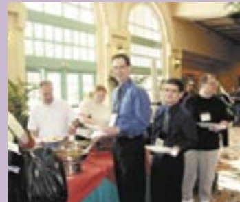
Breakfast and lunch included.