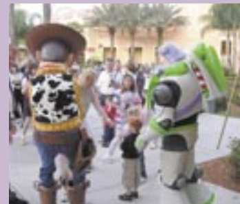
Attendees and their families are encouraged to attend the networking party.